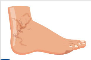
3 Varicose Veins in the Foot