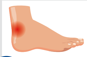
4 Ankle and Hand Traumas

* CO2 is a natural, chemical and technical therapeutic mean which is effective in treatment of diabetic foot and has no side effects when used for the proper indications and in proper dose and can be used for other patient with vascular disease other than diabetic (atherosclerosis, burger disease) and also can be use in treatment of diabetic neuropathy.