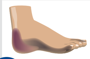
2 The Beginning of Gangrene