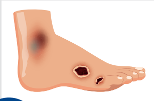
1 Diabetic Foot